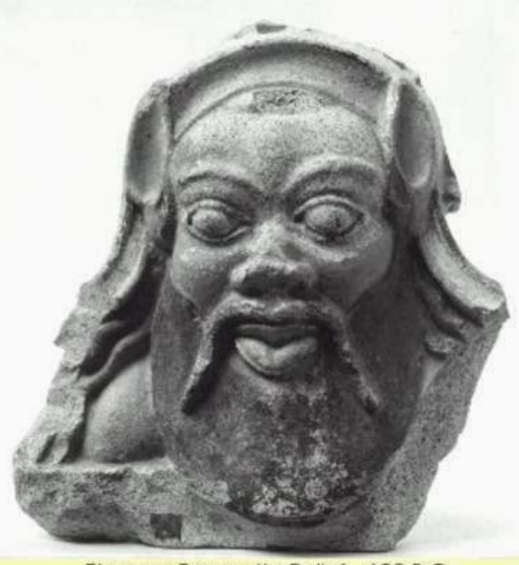
Etruscan Terracotta Relief - 600 B.C.

excellent example of the "Caveman" or Wudewasa type.